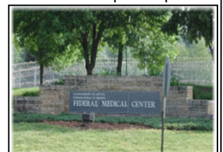
Rochester Federal Medical