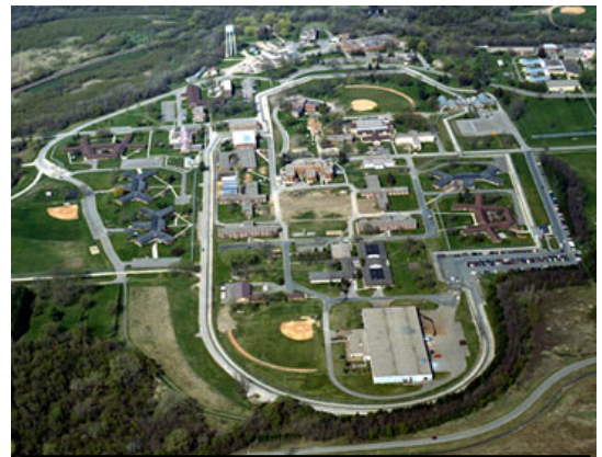
State Prison - Fairbault, MN

Since February 2009, the Federal Medical Center in Rochester, Minnesota has developed a weekly "12 step" study. Men within the inmate population are being trained in hopes of creating a broader influence in the system.