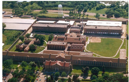
State Prison - Stillwater, MN

The state prison in Faribault, Minnesota is the newest site for CRI. The facility is currently undergoing a multi-phase renovation/expansion project, which is expected to be completed in 2010. In January 2010, Chip LaPole will begin heading the "inside" ministry team. Once again Dale is in the process of going to Celebrate Recovery programs in the area and promoting CRI and the need for a volunteer base to assist at the prison.