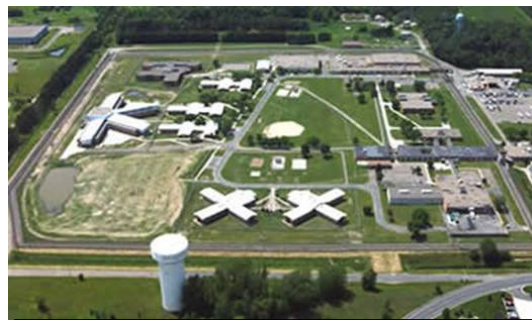
Lino Lakes Correctional Facility

Dale's job is to promote CRI (the recovery ministry designed for incarcerated men) to the various Celebrate Recovery ministries in the state and challenge volunteers to come forward. He will train them and God will develop them for service. Dale visited the CRI program in the correctional facility at Lino Lakes, Minnesota and will be going back to provide training to their leadership. This facility has over 100 men in CRI. Pray that God lifts up volunteers who will dedicate their time and be an example to these incarcerated men.